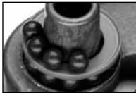
Put 11 Delrin® balls in next race.