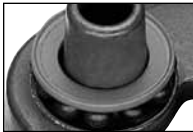
Put on red plastic washer so lip is up.