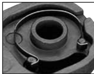
Hook each end of torsion spring around posts.

Tip: Use two springs on each side to stiffen cam action or to act as a backup if first spring breaks.